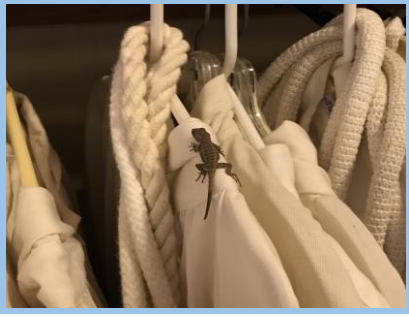
Random Photo of "Frank" ☺